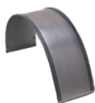
Sieve 0.8 mm