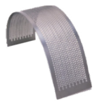
Sieve 5.0 mm