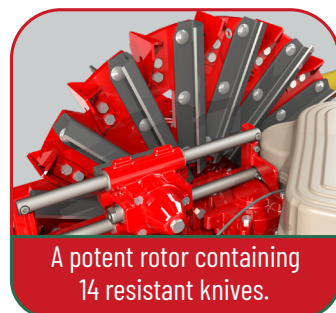
A potent rotor containing 14 resistant knives.