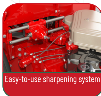
Easy-to-use sharpening system