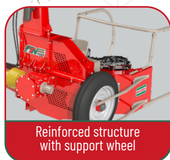
Reinforced structure with support wheel